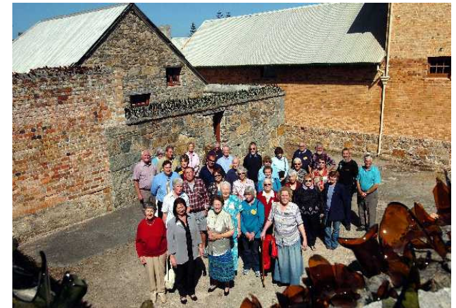
Some of the volunteers of the AHS

In addition to this, the Society conducts regular outings on a monthly basis to places of a historical nature.