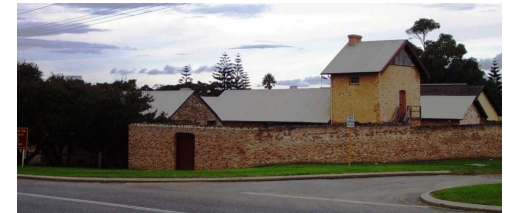
Old Gaol/Convict Hiring Depot

This pamphlet is designed to help encourage you to join the Society and maybe become a volunteer at one of the Society's three premier heritage attractions: