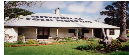
Patrick Taylor Cottage